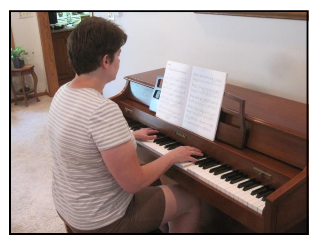
Sitting down to play on a freshly tuned spinet can be a pleasant experience for beginners and more advanced pianists alike!

An owner of a spinet piano has the advantage of playing on an authentic acoustic piano which is conveniently sized—approximately the same dimensions as a digital piano. A spinet is often a good option for the home owner or apartment dweller who doesn't have an abundance of space, but who wants a real piano to play. With proper maintenance, a good quality spinet piano can be a reliable instrument that provides years of musical enjoyment.