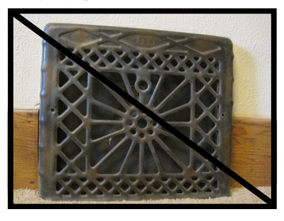
1. Hot air registers—dry, heated air blowing directly on the back of a piano is particularly bad for the soundboard.

Environment: While tuning, repairs and regulation are the job of the technician, seeing to it that your spinet piano is placed in an appropriate spot within the home is up to the owner. What is needed, as much as possible, is a location where temperature and humidity are kept at moderate levels year-round. Drafty locations, or areas where wide swings in either temperature or humidity occur (unheated porches, moldy basements, etc.) are unsuitable for a piano. In particular avoid placing any piano in front of either of the following if at all possible: