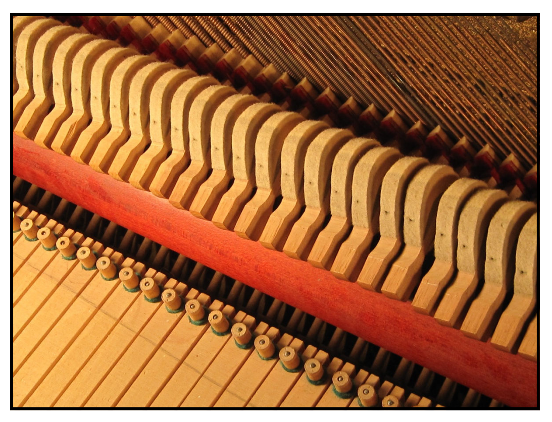
A newly regulated spinet piano action, ready to be played and enjoyed.